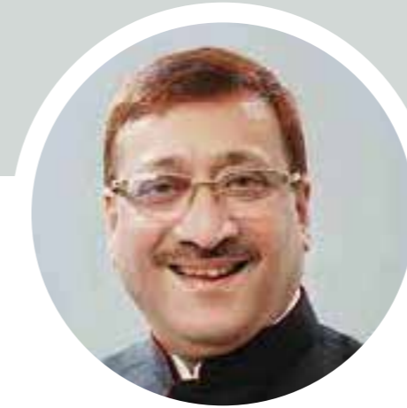
SAMIR KUMAR MAHASETH Hon'ble Minister, Department of Industries Government of Bihar