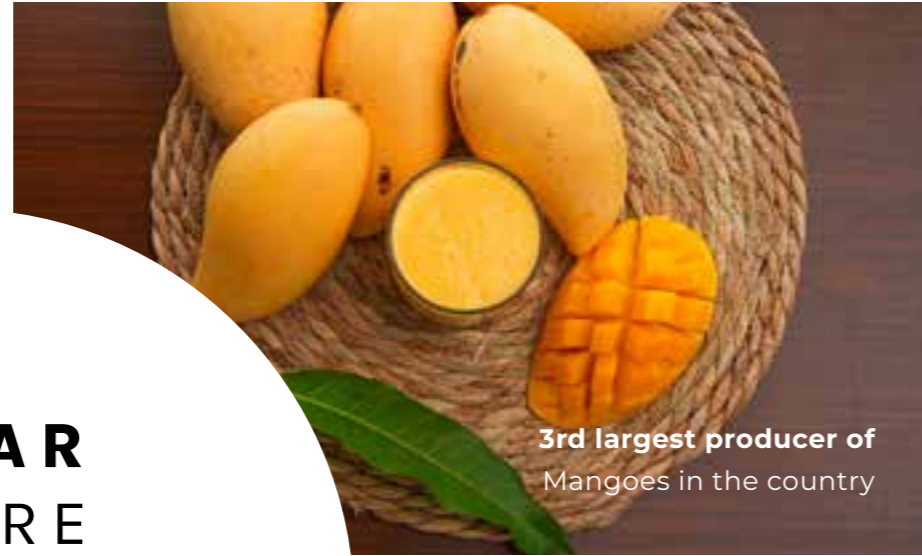
3rd largest producer of Mangoes in the country