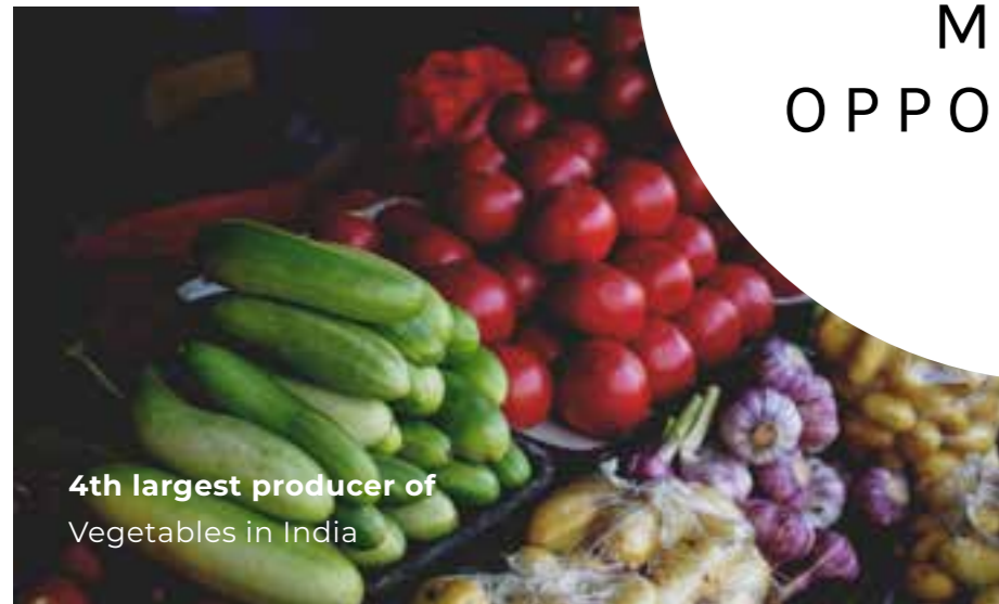
4th largest producer of Vegetables in India