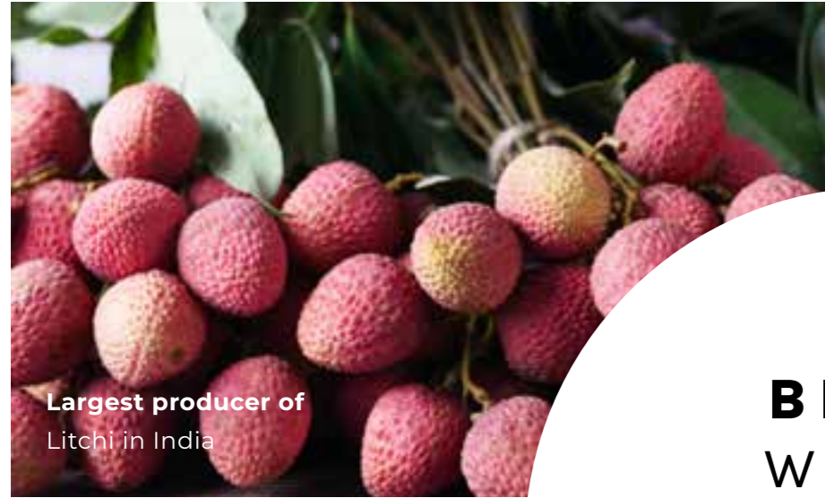
Largest producer of Litchi in India