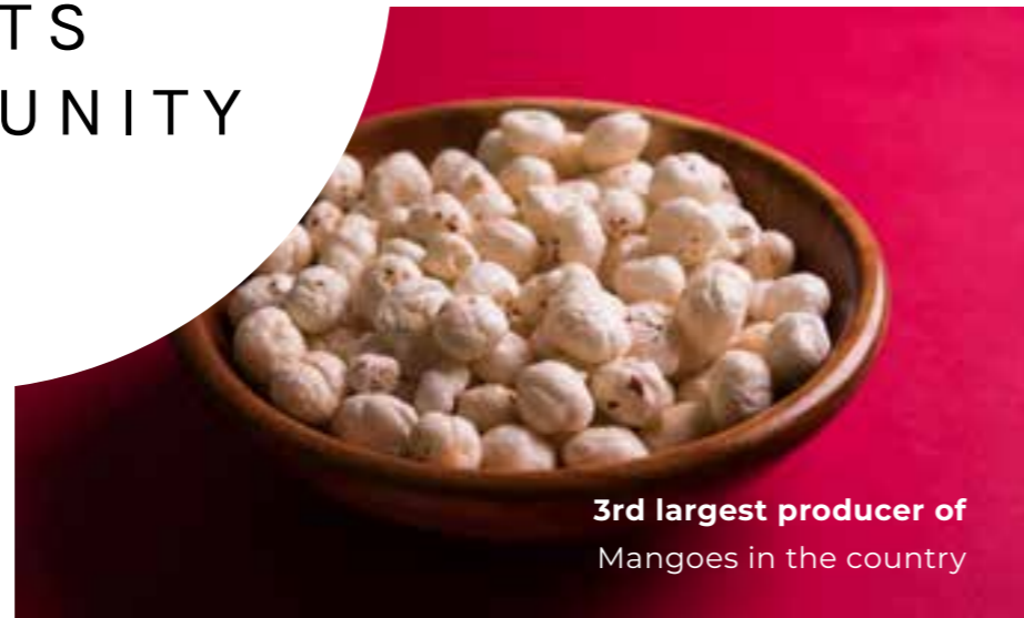
3rd largest producer of Mangoes in the country