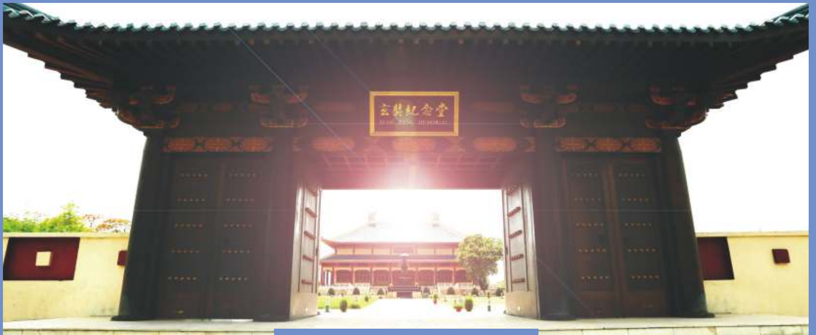
INSIDE OF HIEUN-TSANG MEMORIAL HALL