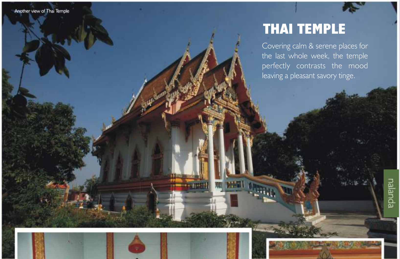
Another view of Thai Temple