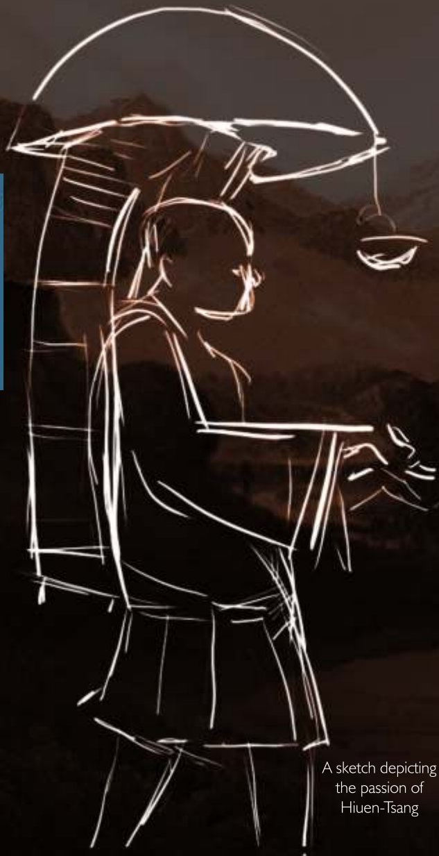
A sketch depicting the passion of Hiuen-Tsang

Believe nothing merely because you have been told it. Do not believe what your teacher tells you merely out of respect for the teacher. But whatsoever, after due examination and analysis, you find to be kind, conducive to the good, the benefit, the welfare of all beings -- that doctrine believe and cling to, and take it as your guide.