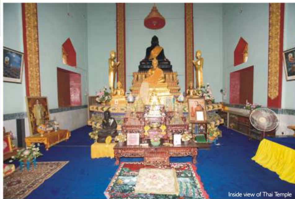
Inside view of Thai Temple