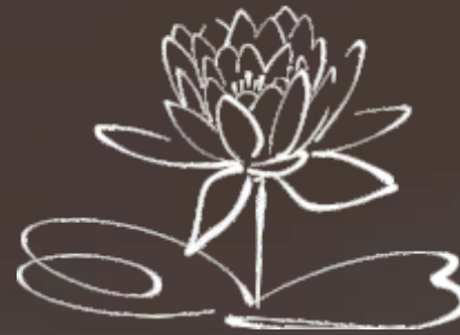
Lotus Flower One of Buddha's symbol

“The way is not in the sky. The way is in the heart.” -Buddha