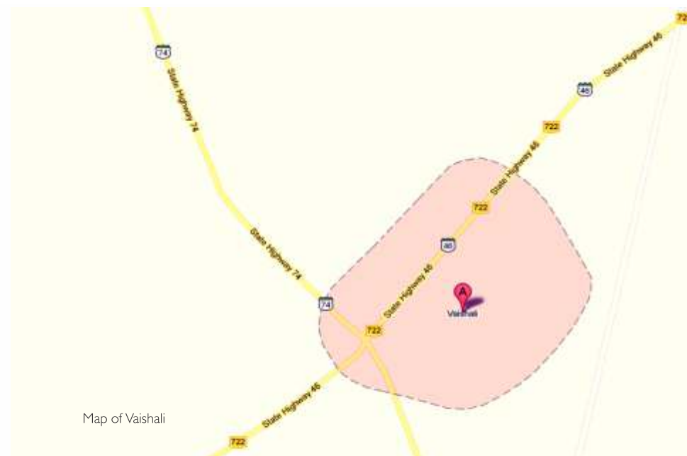
Map of Vaishali