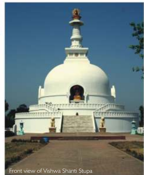
Front view of Vishwa Shanti Stupa

Built by Indosan Nipponji, Japan is claimed to be the world's highest stupa with its height of 146' and the diameter of 120'. Built in 1996, it situates next to 'Abhishek Pushkarini'.