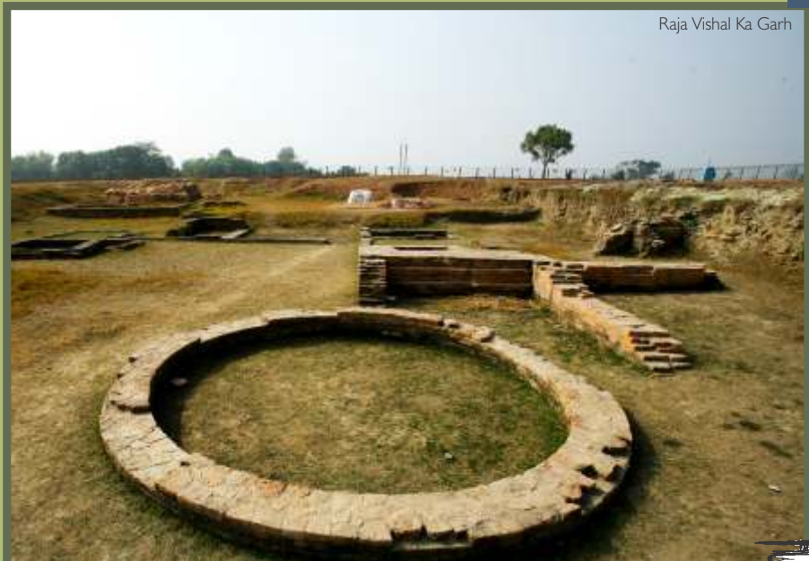
Raja Vishal Ka Garh

This huge mound having a circumference of about 1.5 km was supposed to be the ancient parliament house of the Lichhavi's during 6th Century BC. As per the historians, this was the seat of the world's first republic system. The ruin that appears as a fort is believed to have been the meeting point of the 7707 members in the Republic of Viashali. There are many archaeological artefacts which were found during the excavation of this region that are kept at the Chechar Museum and Vaishali Archaeological Museum.