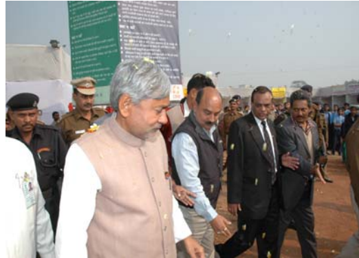
{Chief Minister arriving the exhibition venue}

The Exhibition was inaugurated by Hon'ble Chief Minister of Bihar Sri Nitish Kumar by lighting the 'Chetna' lamp. He expressed his happiness at the initiatives taken by the department.